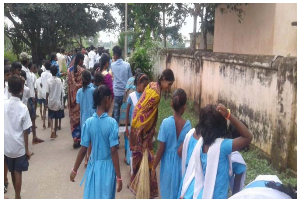
EWRs of Bourgaon GP participate in the Grama samrudhhi and swachhata pakshya